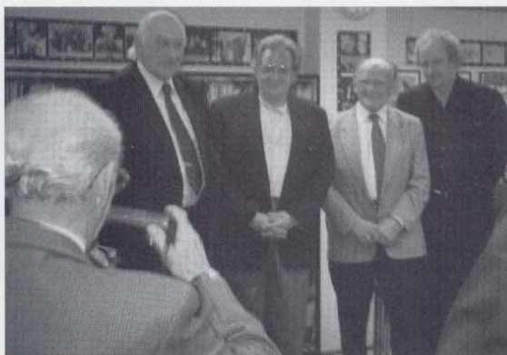
The celebrities being "snapped" from left to right are Tony Crombie, Stan Tracey, Jack Fallon and Digby Fairweather.

Stan was eager to learn about bebop having primarily been involved with dance music before plus a stint in a Gipsy Accordion Band wearing Gipsy costumes and a half inch of make-up!